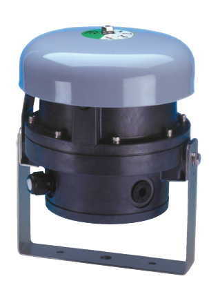
Applications - General signalling; telephone ringing; fire and process control alarm